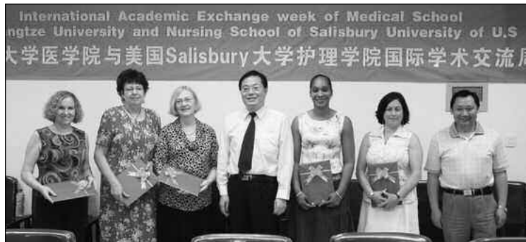
SU faculty at Yangtze University, Jingzhou, China

Both of these programs include credit bearing nursing courses of various amounts. Please contact the faculty members for specific details.