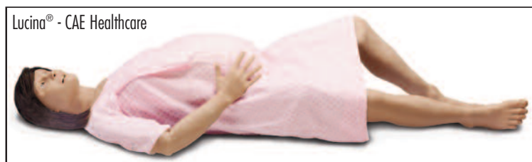
Lucina® - CAE Healthcare

Lucina is primarily a birthing simulator and can be used to simulate a variety of scenarios, including normal vaginal delivery, shoulder dystocia and breech delivery. Other scenarios include pre-eclampsia with seizures and post-partum hemorrhage. A simulated full-