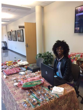
SU SWSA USMH members held a Bake Sale to raise money for their Holiday activity, Thanks A