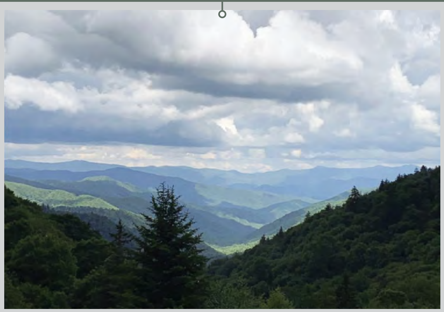
"Great Smoky" lan Leverage