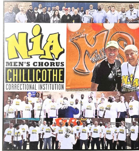
NIA MEN'S CHORUS AT CHILlicothe CORRECTIONAL INSTITUTION FAMILY DAY PROGRAM WEDNESDAY, JULY 26, 2023