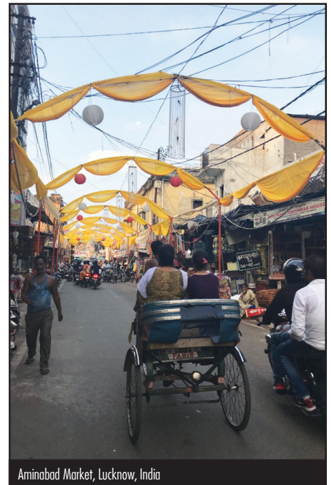
Aminabad Market, Lucknow, India