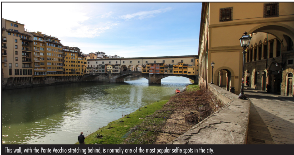
This wall, with the Ponte Vecchio stretching behind, is normally one of the most popular selfie spots in the city.