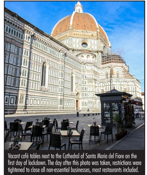
Vacant café tables next to the Cathedral of Santa Maria del Fiore on the first day of lockdown. The day after this photo was taken, restrictions were tightened to close all non-essential businesses, most restaurants included.