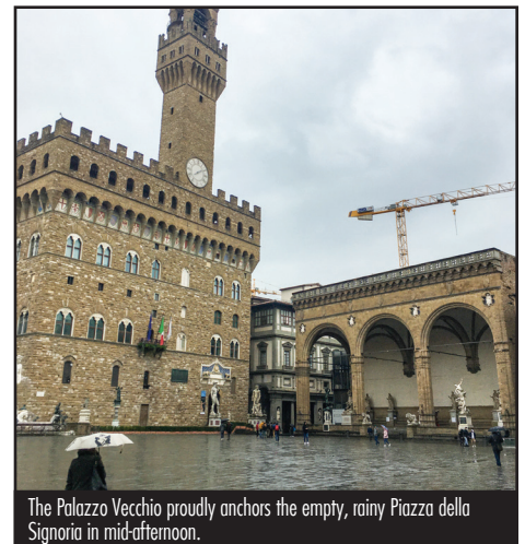
The Palazzo Vecchio proudly anchors the empty, rainy Piazza della Signoria in mid-afternoon.